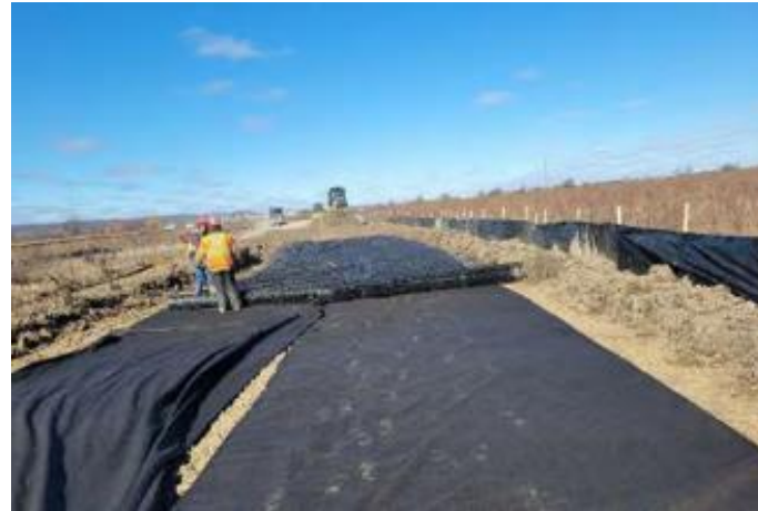
Placement and compaction of granular