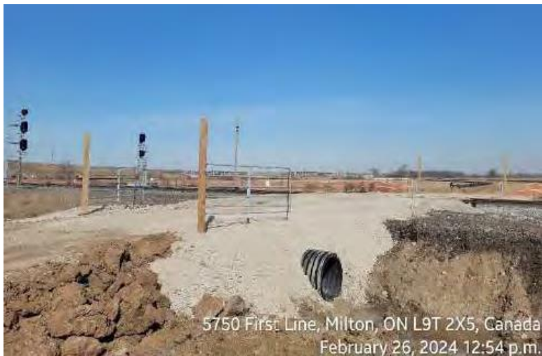
5750 First Line, Milton, ON L9T 2X5, Canada February 26, 2024 12:54 p.m.