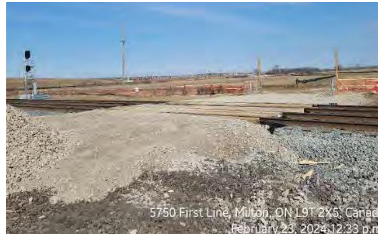
5750 First Line, Milton, ON L9T 2X5, Canada February 23, 2024, 12:33 p.m.