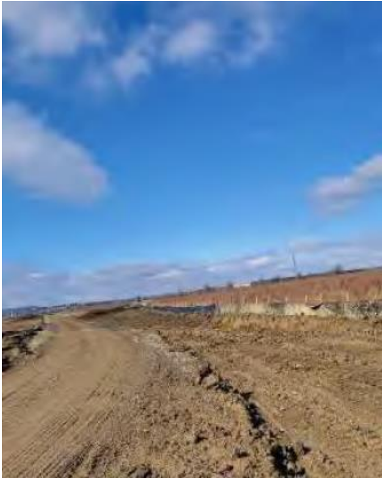
Completion of vegetation removal