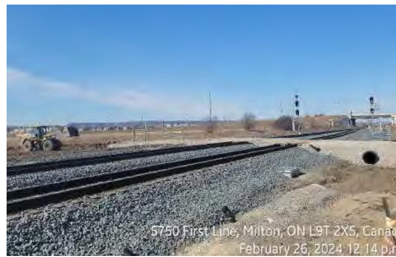
5750 First Line, Milton, ON L9T 2X5, Canada February 26, 2024 12:14 p.m.