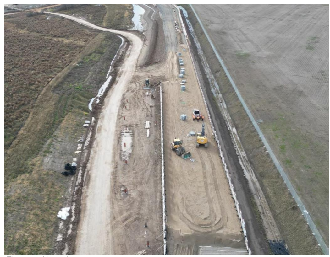
Figure 4 – November 19, 2024

Preparation of approaches to truck overpass