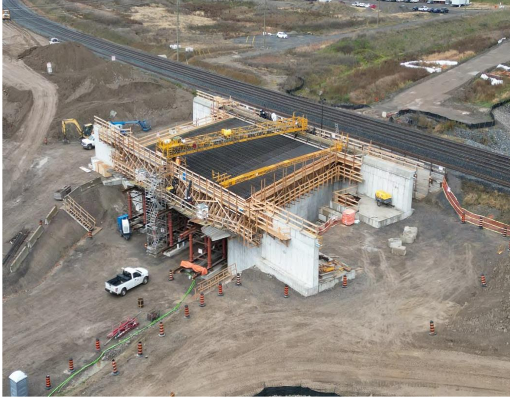
Figure 5 – November 19, 2024

Bridge construction with visible framework