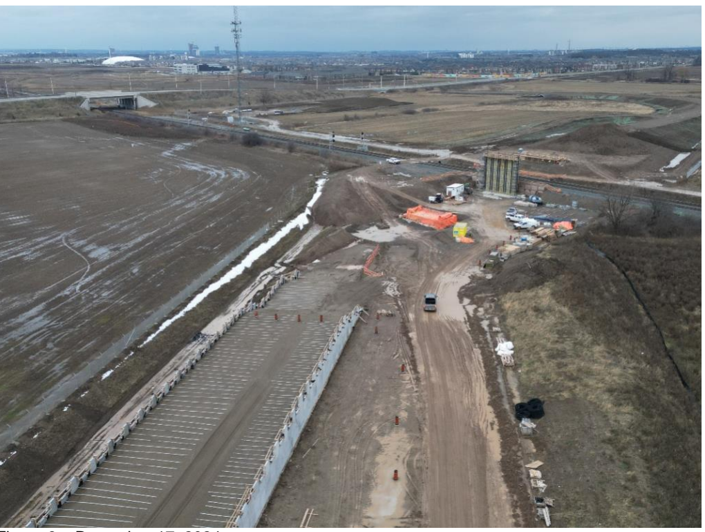
Figure 8 – December 17, 2024

Bridge Construction and Reinforced Soil Slope Wall (RSS) Progress