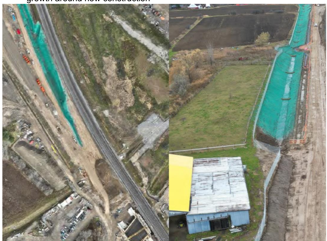
Figure 3 – November 19, 2024

Application of hydroseed mixture to stabilize soil and promote vegetation growth around new construction