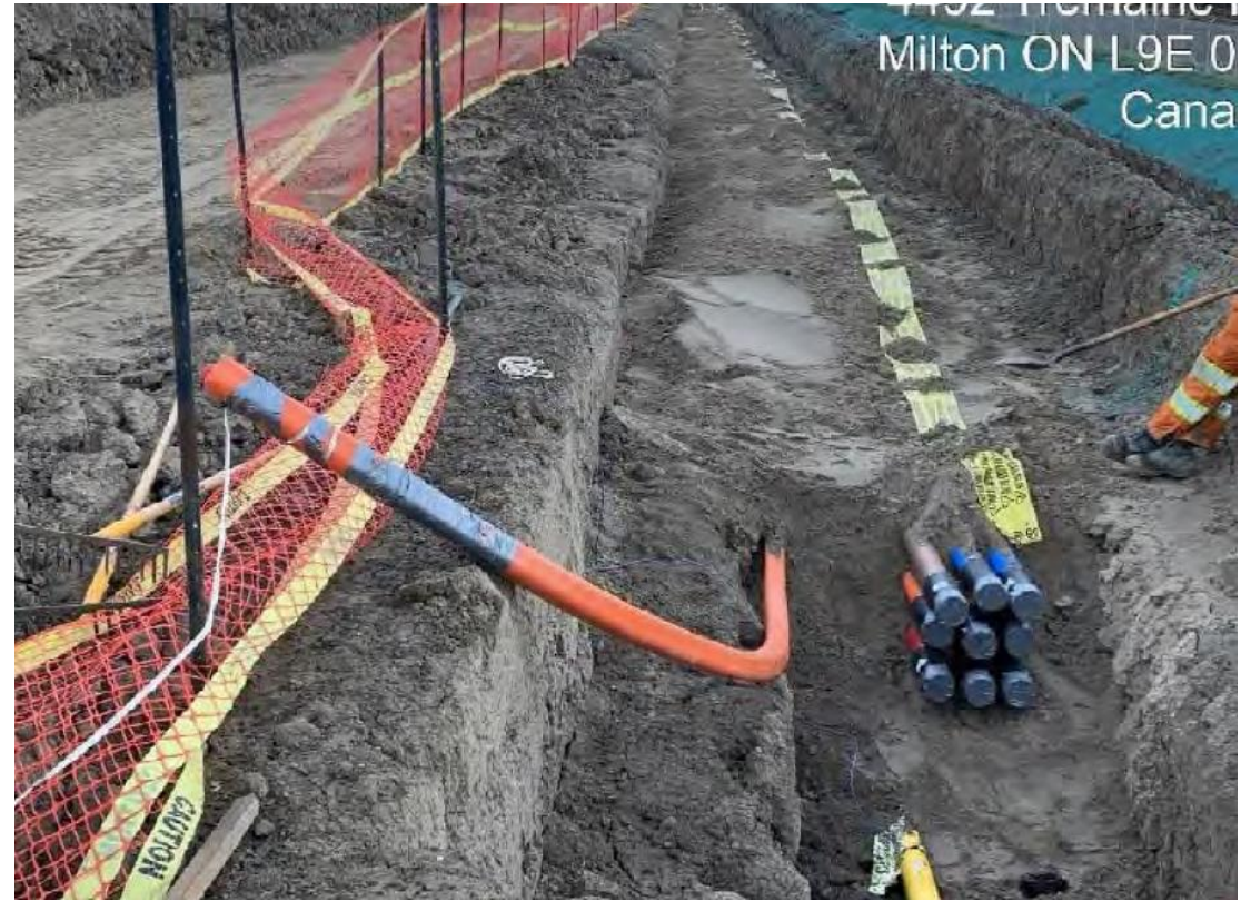
Figure 1 – October and November, 2024

Trenching and installation of conduit systems alongside the realigned mainline deck