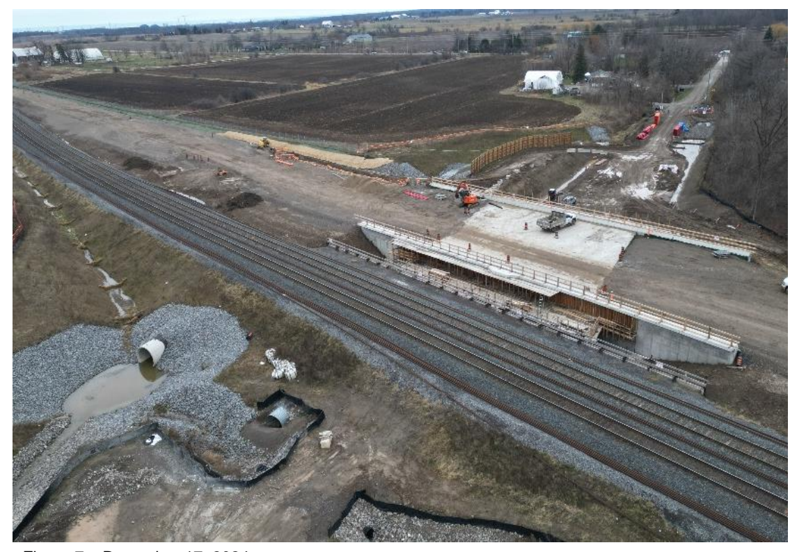
Figure 7 – December 17, 2024

Bridge construction with visible framework