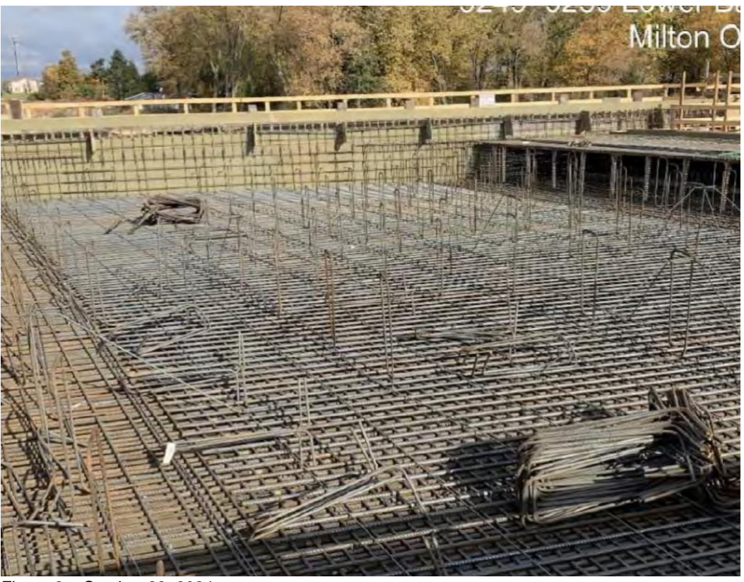
Figure 2 – October 28, 2024

Installing rebar chair supports to reinforce the concrete bridge deck