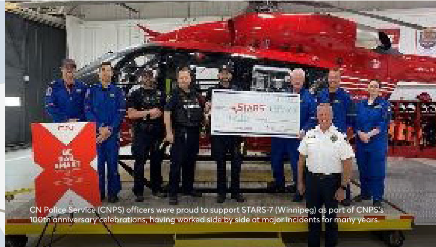
CN Police Service (CNPS) officers were proud to support STARS-7 (Winnipeg) as part of CNPS's 100th anniversary celebrations, having worked side by side at major incidents for many years.