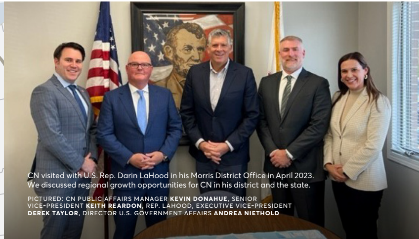
CN visited with U.S. Rep. Darin LaHood in his Morris District Office in April 2023. We discussed regional growth opportunities for CN in his district and the state.