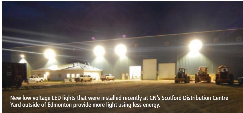
New low voltage LED lights that were installed recently at CN's Scotford Distribution Centre Yard outside of Edmonton provide more light using less energy.