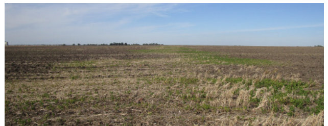
Looking north from site's south boundary