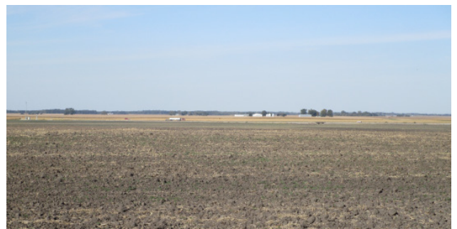
Looking north across the northern half of site

Highways: Interstate 57 (7.7 mi. to the east)