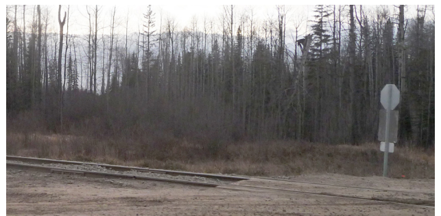
View looking southwest across CN rail line at the property.