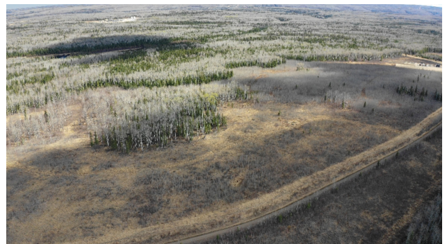
Aerial view of property looking northwest with CN rail line in the foreground.

*Alberta Petrochemical Incentive Program may be available for petrochemical projects