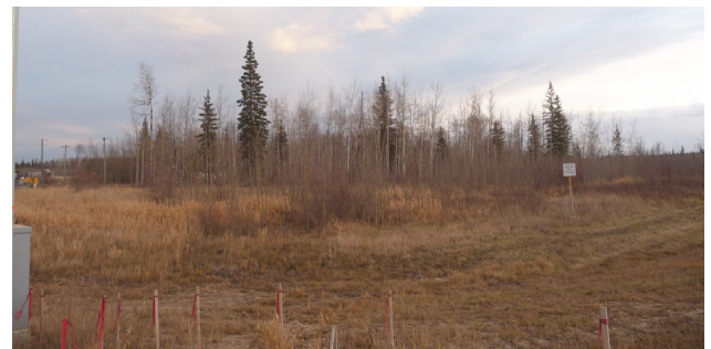
View from Hwy. 40 looking southeast across the property.