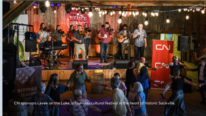
CN sponsors Levee on the Lake, a four-day cultural festival in the heart of historic Sackville.