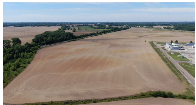
Aerial view looking south