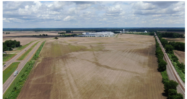
Aerial view looking north with CN tracks on right, hwy 51 on left

Ideal, but not limited to: agricultural, automotive, renewables and steel manufacturing