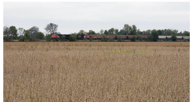
View from property looking southeast (CN train)