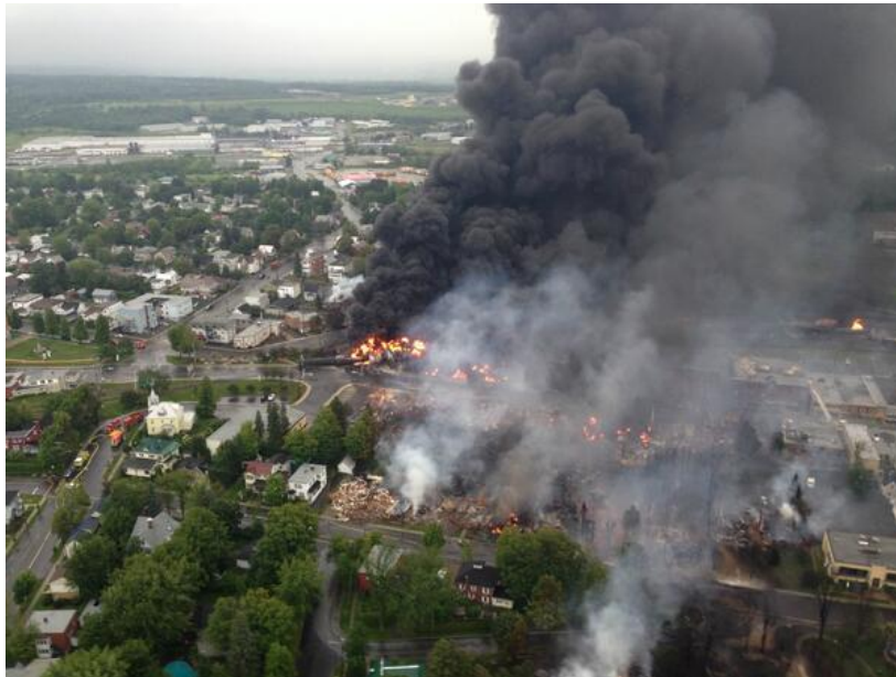
Figure 3 – Derailment in Lac-Megantic, Quebec on July 9, 2013

any number of tank cars are likely to derail. As noted by the HHFT On-Scene Incident Commander Field Guide 2 , the initial stress and release behaviors of railcars will be directly influenced by the speed of the train and kinetic energy associated with the derailment. In the data set of twelve HHFT events examined in this report, an average of 22 cars were derailed per incident, with an average of 14 railcars subsequently experiencing a breach and/or on fire. Figure 3 below depicts the scene of a derailment that occurred in Lac-Megantic, Quebec 7 on July 9, 2013, in which the destructive nature and three-dimensional aftermath of an HHFT incident can be seen.