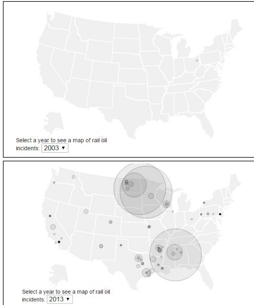
Figure 2 – Increase in crude oil spills in the United States between 2003 (top) and 2013 (bottom) 5

(“U.S. Rail Crude Oil Traffic”, Association of American Railroads, November 2015, https://www.aar.org/BackgroundPapers/US%20Rail%20Crude%20Oil%20Traffic.pdf )