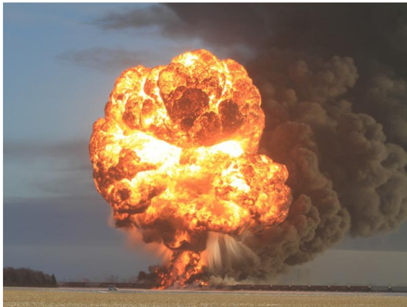
Figure 6 – Tank car explosion during the Casselton, ND derailment December 30, 2013 9

The incident growth phase occurs as a result of mounting heat from initial derailment fires. Per both the data set discussed in this report and the On-Scene Incident Commander Field Guide 2 , incident growth occurs over a time period somewhere in the range of 30 minutes to 4 hours. As fire spreads throughout the derailment wreckage, thermal stress may be inflicted on surrounding railcars not initially involved in the fire. Extreme heat and pool fires can quickly produce heat induced tears, increased pool fire sizes, and cause pressure relief venting; all which consequently lead to greater involvement at the scene. Additional railcar breaches may occur, and if left completely unchecked, deflagrations and explosions can take place as the event continues to intensify 9 (see Figure 6).