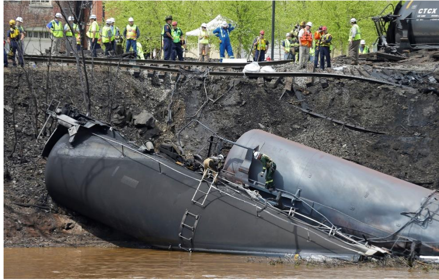
Figure 4 – Derailment in Lynchburg, Virginia effecting the James River