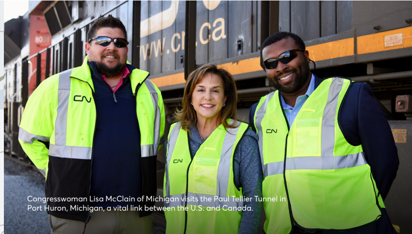
Congresswoman Lisa McClain of Michigan visits the Paul Tellier Tunnel in Port Huron, Michigan, a vital link between the U.S. and Canada.