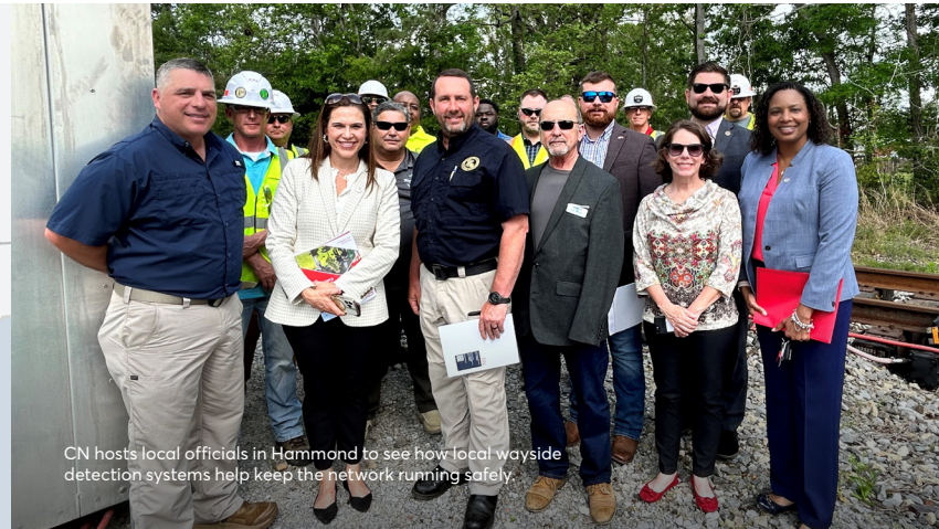
CN hosts local officials in Hammond to see how local wayside detection systems help keep the network running safely.