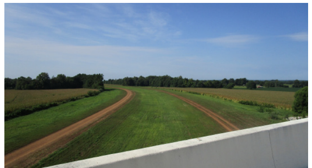
Future Interstate 69 right-of-way