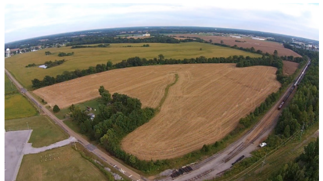
Looking Southeast across the site