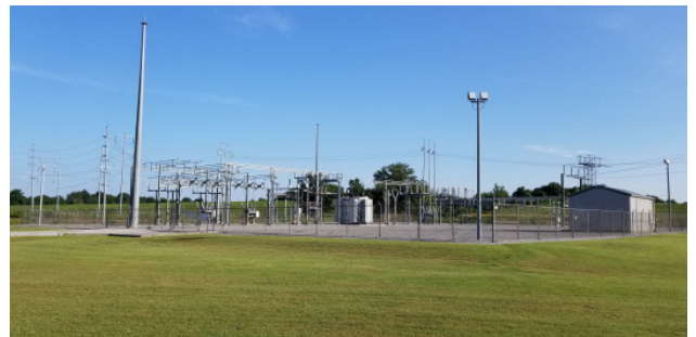
Union City Electric Authority's substation adjacent to site